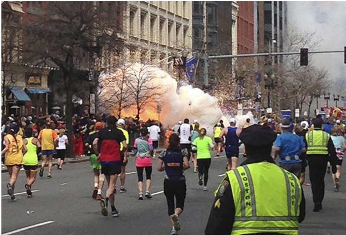
Runners head toward the finish line of the 2013 Boston Marathon as an explosion erupts.

movie theater, a music concert and even a spa, tourists are advised to avoid all places of recreation and entertainment.