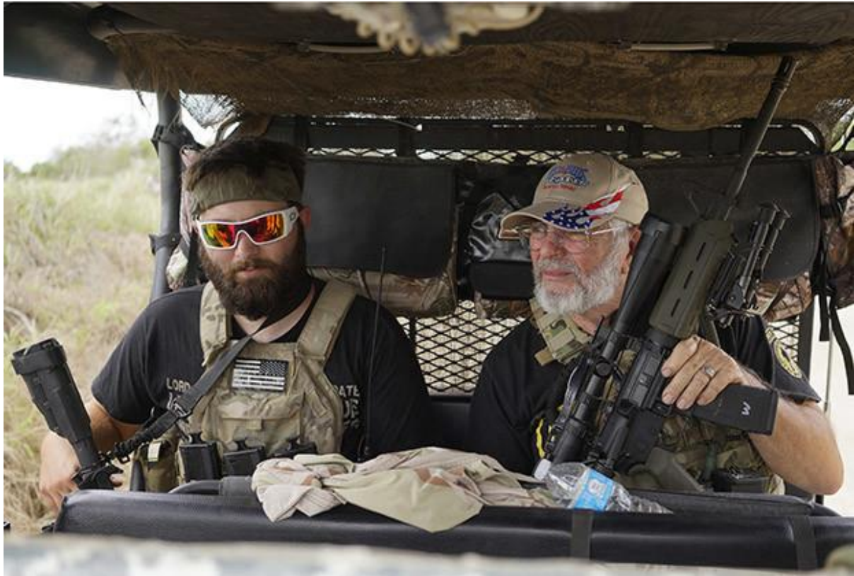
Vigilantes go on patrol in September near the U.S.-Mexico border outside Brownsville, Texas.