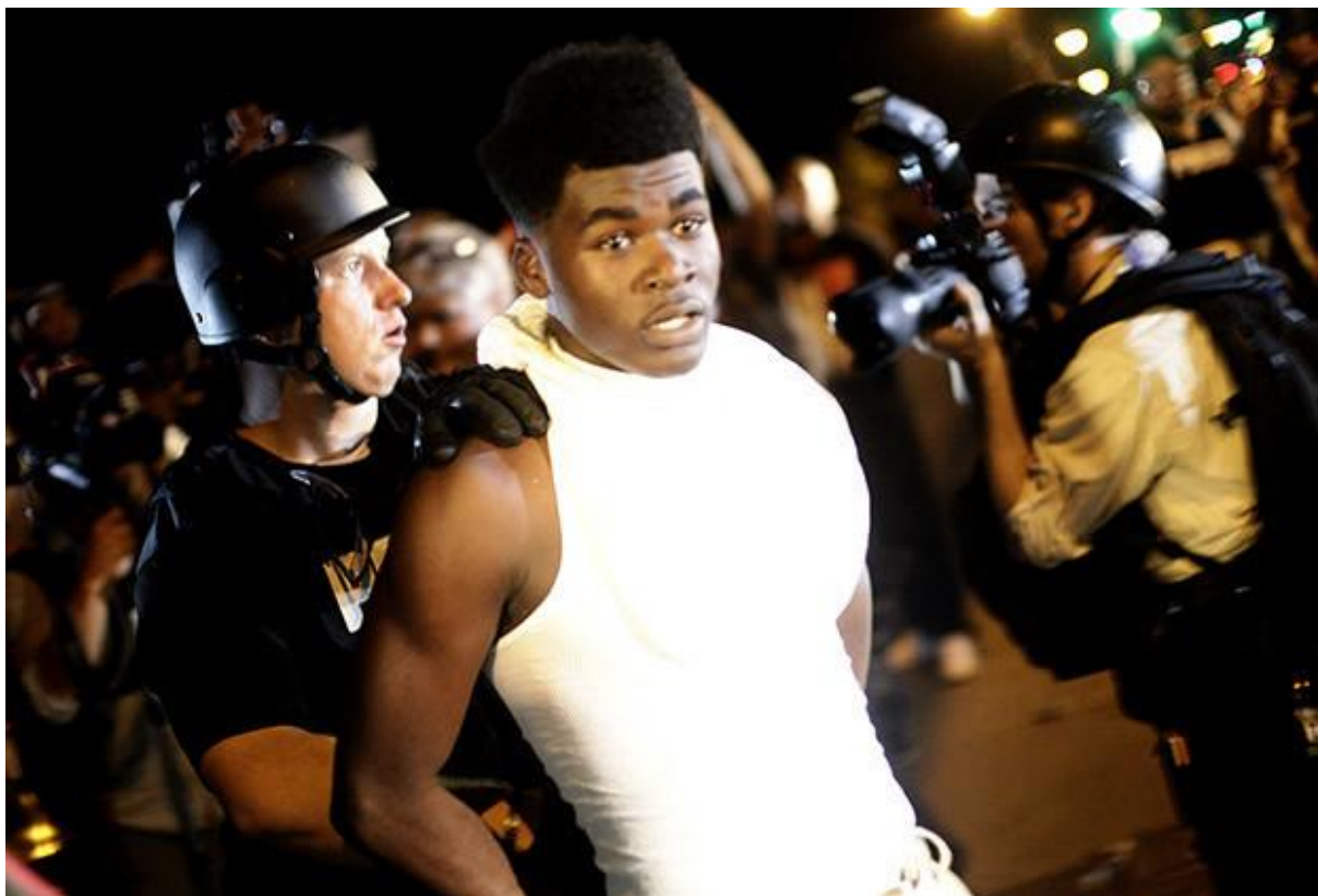
A police officer in riot gear detains a demonstrator protesting on Aug. 19 against the shooting of Michael Brown in Ferguson, Missouri.

Visitors belonging to a minority race should use particular caution when traveling to areas of the United States where police officers may be present. Ethnic and religious divisions continue to permeate political discourse across the country. Inflammatory sectarian rhetoric is particularly high in the nation's capital, and in recent years has escalated so severely as to cause a complete shutdown of the federal government. Travelers should prepare an emergency evacuation plan in case of government shutdown.