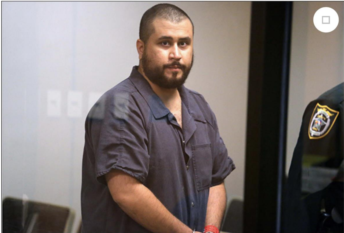
George Zimmerman was acquitted in July 2013 of all charges in the shooting death of unarmed black teenager Trayvon Martin, in an alleged "stand your ground" shooting.

intruder. Research suggests that a white person who penalizes someone of a minority race in this way is 17 times more likely to be absolved of any wrongdoing than a minority who penalizes a white person. Minority travelers are therefore advised to try harder to avoid being perceived as threatening.